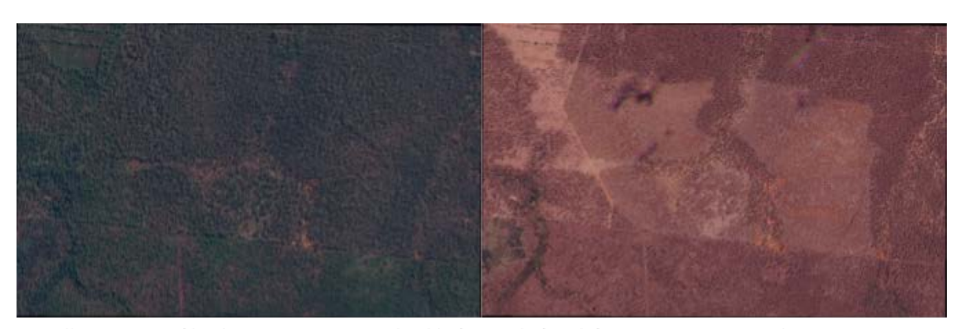
Satellite imagery of land in Wyoming, Queensland before and after deforestation. Image 1: July 2022 Image 2: September 2023