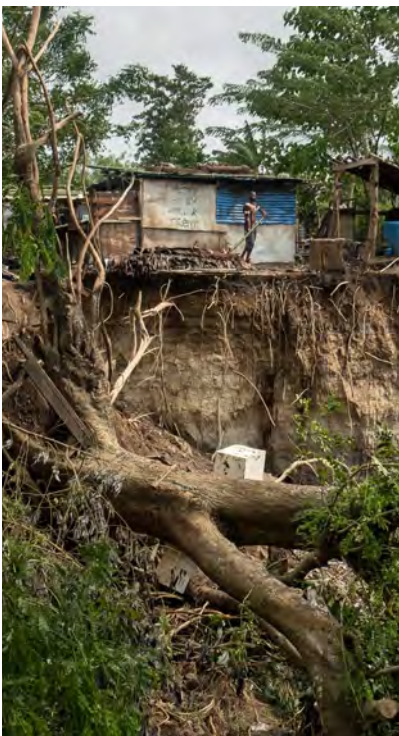
Impacts of category 4 Tropical Cyclone Donna in Vanuatu, 2017.

As a caveat, due to the complexity and intangible nature of non-economic losses and damages such as loss of life and cultural heritage, this report focuses only on the economic losses and damages that can be more readily monetarily quantified.