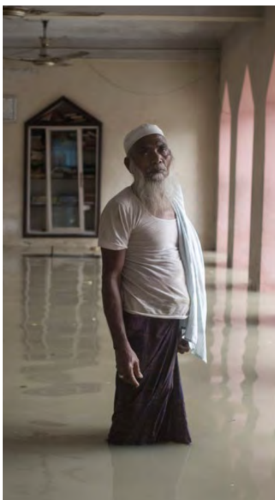
A man stands knee deep in flood water in a mosque under arches.

For example, between 2010-2020, Fiji was hit by 9 cyclones costing AUD $1.66 135 billion in losses and damages. 137 The AUD $11.6 billion spent on fossil fuel subsidies in 2021-22 could fund the redress of these damages six times over.