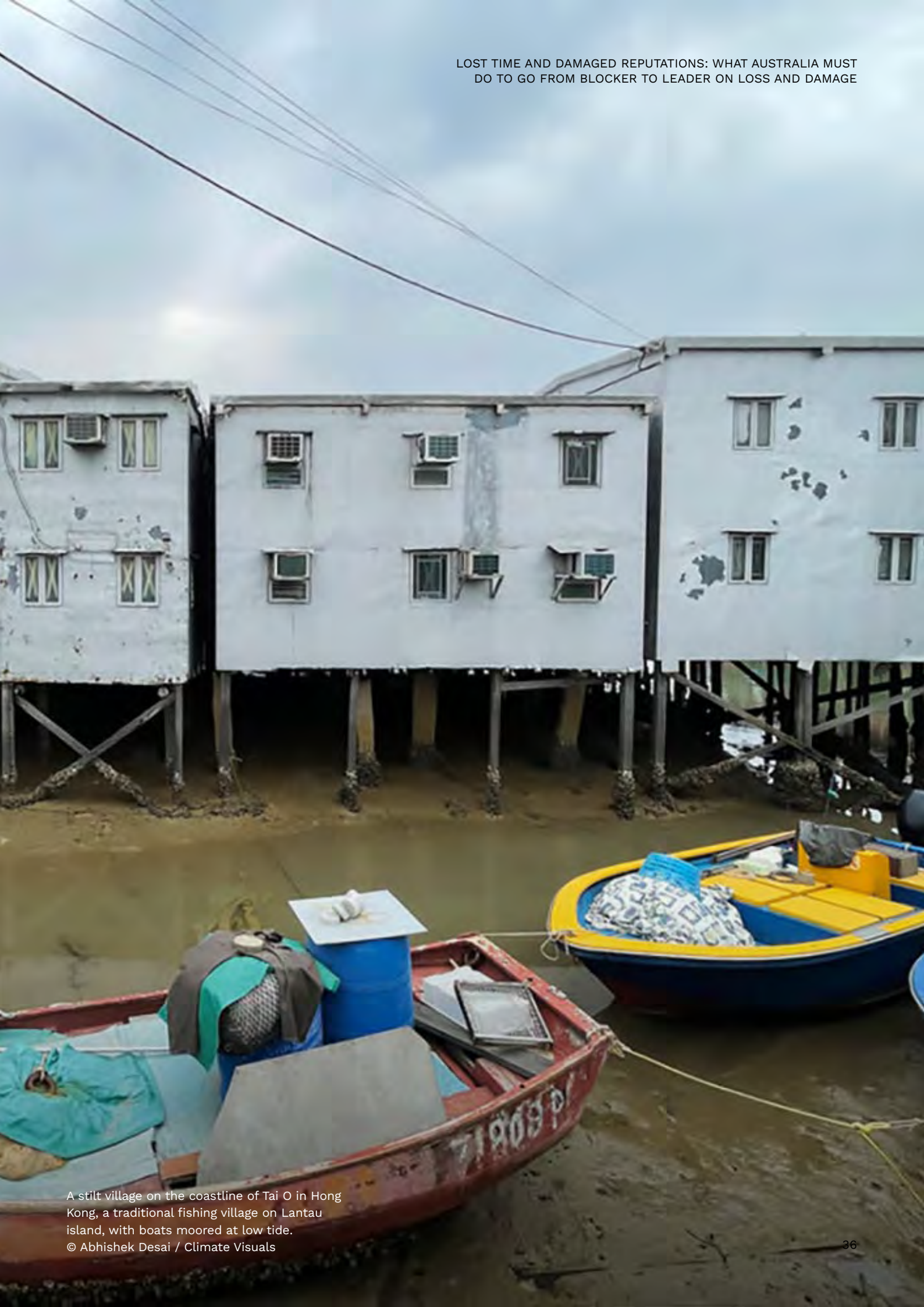
A stilt village on the coastline of Tai O in Hong Kong, a traditional fishing village on Lantau island, with boats moored at low tide.