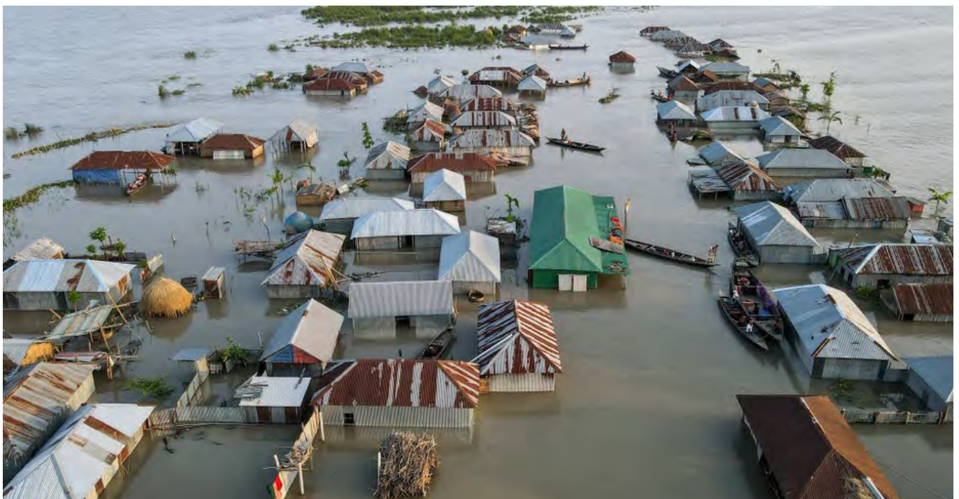
An aerial view of a village submerged in sea water.

In the lead up to COP27, loss and damage, and the delivery of funds from major polluters in the Global North to climate impacted countries in the Global South has become a top priority. This issue is of particular importance to our Pacific neighbours due to their ongoing advocacy and leadership on loss and damage finance, but also their continuing experiences of loss and damage.