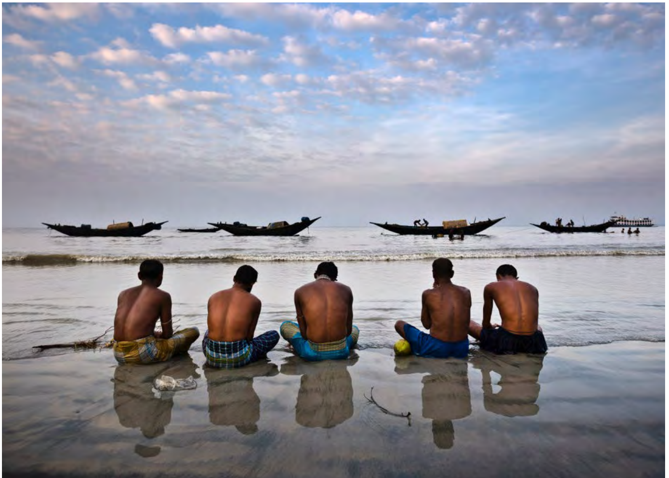
A row of men seated on the wet sand at low tide, praying for a benevolent sea, before going fishing.

By implementing some of these proposed financial sources, Australia could deliver genuinely additional, ongoing finance to address loss and damage that targets major polluting individuals and companies. These forms of finance do not place additional burdens on government budgets and align with the polluter pays principle. 148