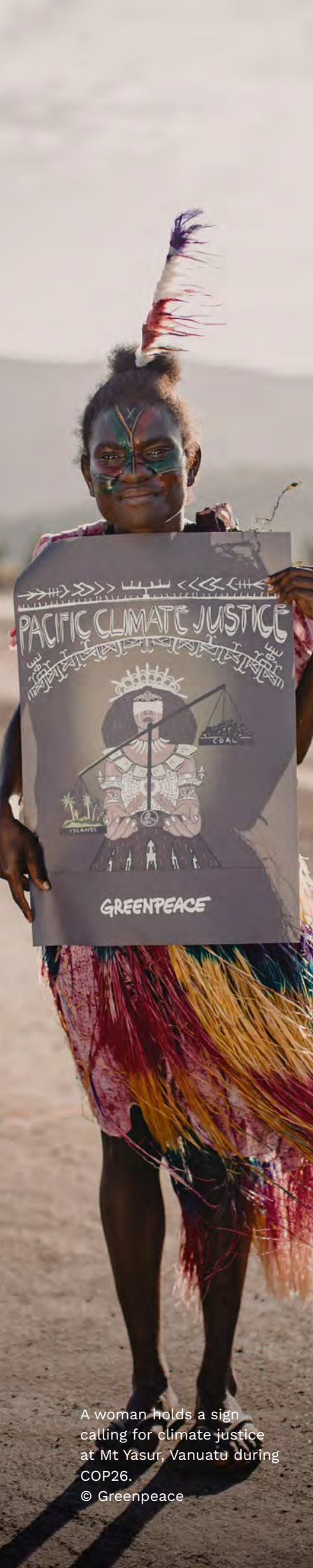
A woman holds a sign calling for climate justice at Mt Yasur, Vanuatu during COP26.