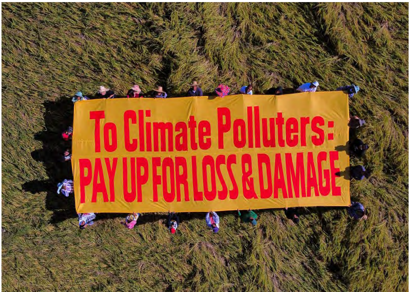
Farmers' Protest in Gerona, Philippines

At COP27, the Albanese government has a clear opportunity to show leadership by supporting the establishment of a Loss and Damage Finance Facility and committing funds.