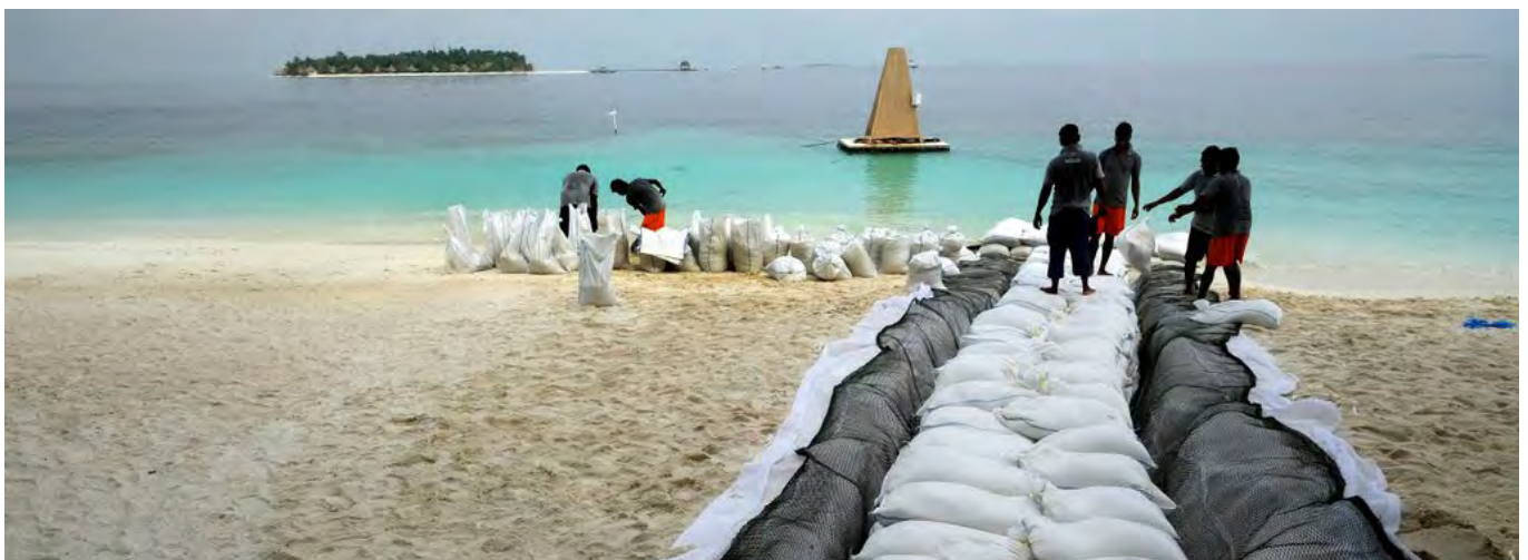
Men working on the construction of a levee with sandbags for protection against erosion in the Maldives.

To truly deliver on its promises to take strong action on climate change and support the Pacific, the Albanese Government must support the establishment of a Loss and Damage Finance Facility at COP27.